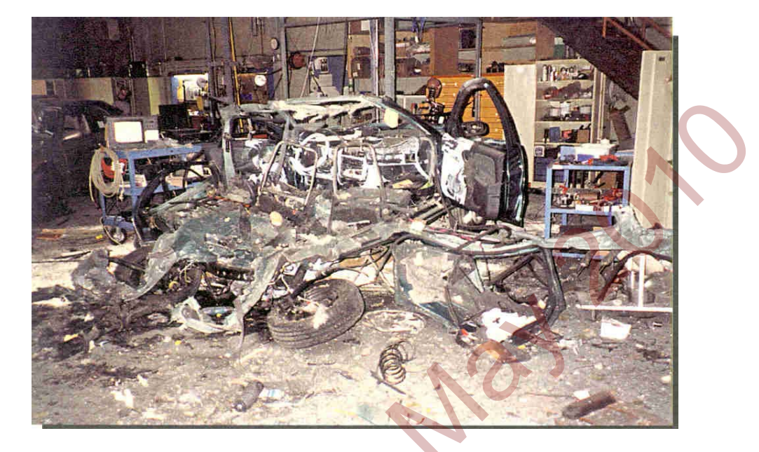
Figure 2 Results of an explosion due to inadequate purging

Inerting displaces or dilutes the hydrocarbons in the vessel, tank or piping system with an inert (non-flammable and non-reactive) gas such as nitrogen or carbon dioxide, or a compatible inert liquid such as water. The atmosphere must remain non-explosive while workers perform their work. During the work, all ignition sources must be controlled so that they cannot trigger a fire or explosion.