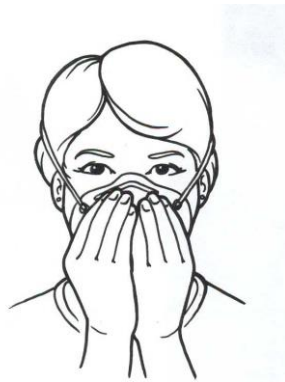
Figure 3 Positive pressure user seal check – Disposable filtering facepiece respirator

For disposable respirators, the user seal checks are done somewhat differently. For non-valved disposable respirators, both hands must be placed completely over the respirator while the wearer exhales. The respirator should bulge slightly. For disposable respirators that have a valve, both hands should be placed over the respirator and the user inhales sharply. The respirator should collapse slightly. If air leaks at the edges of the respirator, it should be re-positioned and adjusted for a more secure fit and the test repeated. If the seal check cannot be successfully completed, another type/style/size of respirator should be tried.